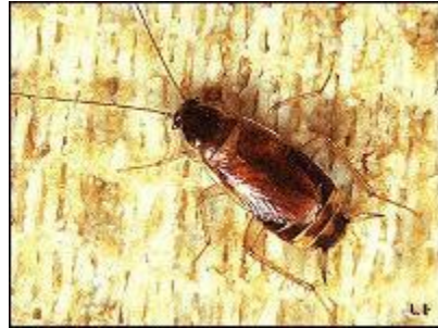
Figure 6. Brownbanded cockroach (actual size, 3/4").

The Asian cockroach ( Figure 7 ) looks very much like a German Cockroach, except it flies. Asian cockroaches are attracted to the lights in your home. They will fly to porch lights and find their way inside. Once inside, however, their survival is poor like other outdoor cockroaches.