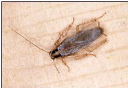
Figure 7. Asian cockroach (actual size 5/8").

The Asian cockroach ( Figure 7 ) looks very much like a German Cockroach, except it flies. Asian cockroaches are attracted to the lights in your home. They will fly to porch lights and find their way inside. Once inside, however, their survival is poor like other outdoor cockroaches.