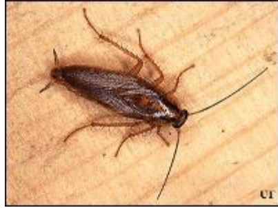
Figure 5. German cockroach (actual size 5/8").