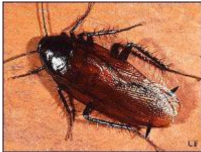
Figure 2. Smokybrown cockroach (actual size, 1 3/4").