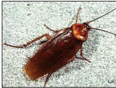
Figure 1. American cockroach (actual size, 1 1/2").

The kinds of cockroaches most commonly found in and around Florida homes are the Florida Woods Roach, American ( Figure 1 ), smokybrown ( Figure 2 ), brown ( Figure 3 ), Australian ( Figure 4 ), German ( Figure 5 ) and Asian. The smallest cockroaches, the German, Asian, and brownbanded ( Figure 6 ), are close to the same size and the adults are seldom more than 5/8" long. The larger cockroaches, the American, Australian, brown, and the smokybrown, are 1 1/4" - 2" long and are often called palmetto bugs. Though they are generally found outdoors, they can become an indoor problem when they migrate or are carried indoors. The largest cockroach, the Florida woods roach, will also enter dwellings from the outside or from beneath the house. Outdoor cockroaches do not survive well indoors and many times people overreact to the presence of these cockroaches. Often, removal of these outdoor cockroaches from the house is all that is needed for control.